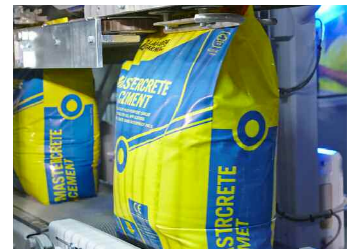
Filled bag before entering the closing station