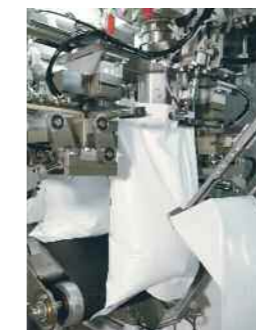
Bag at the filling spout

The INTEGRA® LIFFS® offers you a variety of convincing advantages: