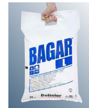
PE bag – with handle on request

HAVER & BOECKER INTEGRA® LIFFS® – the economically and ecologically perfect solution – from production to consumption.