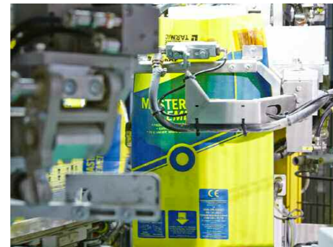
Bag handling and bag placer

HAVER & BOECKER ROTO-PACKER® 6-10 ADAMS® Edition – Cleanliness and efficiency from production to consumption.