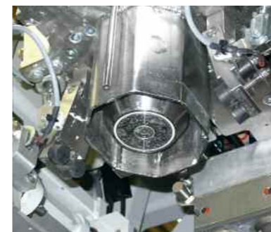
High speed filling spout